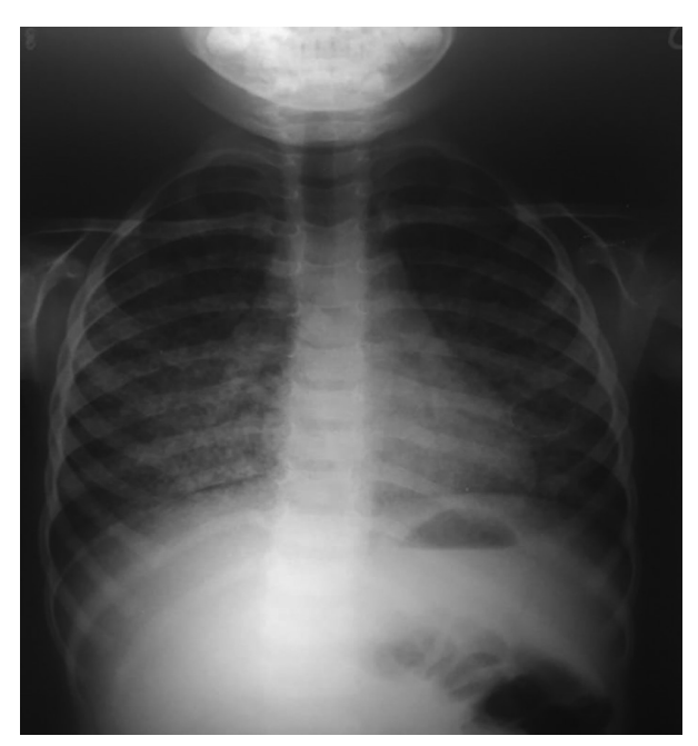
Figure 1. Chest X-ray. Front chest X-ray: micronodular infiltrate with predominant right hemithorax.

The patient remained hospitalized at the Hospital Posadas, with the following tests requested: a) tuberculin test: PPD (purified protein derivative) RT 23 (2TU): 0mm; b) gastric